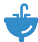
STEP 6 Turn water off with paper towel