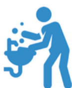
STEP 3 Lather hands for 20 seconds