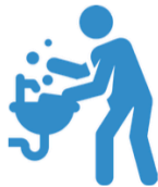
STEP 3 Lather hands for 20 seconds