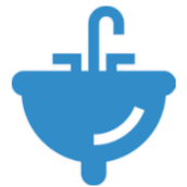
STEP 6 Turn water off with paper towel