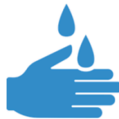
STEP 4 Rinse hands